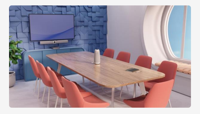
Meeting Owl 3 + Owl Bar

Wirelessly pair with the Owl Bar or a second Meeting Owl for collaboration in larger spaces