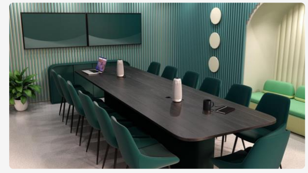
MEETING OWL 3 + MEETING OWL 3